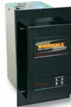
From 1500 sq. ft to 4000 sq. ft Home *Commercial 2000 cfm model also available