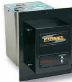
Up to 1700 sq. ft Home