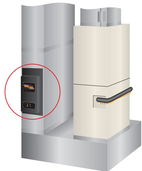
Return or Supply Plenum Installation